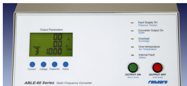
The comprehensive digital display shows output voltage, current, frequency, power and power factor.

The ABLE-60 series includes 8 models ranging from 4KVA to 40KVA. All share the same comprehensive digital display panel, but with Failsafe's trade-mark simplicity of operation.