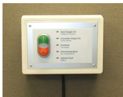
Remote Control Panel up to 200 metres away.

A remote control panel is available allowing the converter to be monitored and controlled from up to 200m away. In addition, ABLE-60 converters are fitted with an RS485 data bus, permitting all the performance parameters of the converter to be observed remotely. And to complete these extensive remote monitoring facilities, ABLE-60s also have embedded volt-free contacts for all major status conditions.